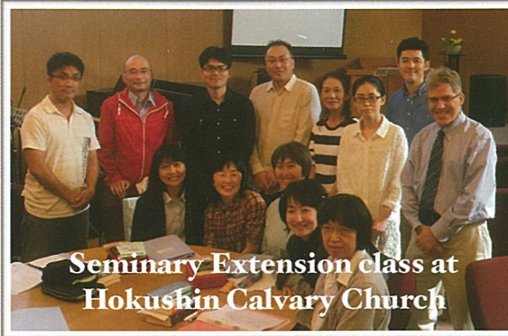
Seminary Extension class at Hokushin Calvary Church

since 1983 with WorldVenture and now Asian Access. We will highlight how God has ministered through you, and articulate the three phases of our vision strategy, Integrity 2025 . PHASE ONE ends in 2018 (see Fukushima Call section). PHASE TWO begins in 2019 and runs through 2022, with a focus on investing in next generation leaders. PHASE THREE , from 2023 through 2025, targets leader development, church consulting and family ministry.