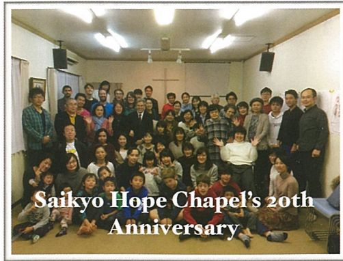
Saikyo Hope Chapel's 20th Anniversary