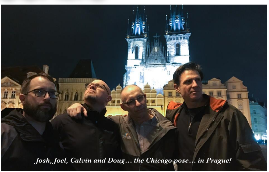
Sonlife Team: No, we're not at Disney World... we're in Prague, Czech Republic with 60 disciple-making leaders from almost 30 countries!