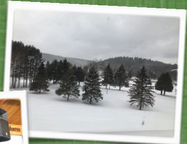
Beautiful Muskoka woods, two hours north of Toronto, was still a winter wonderland in mid March.