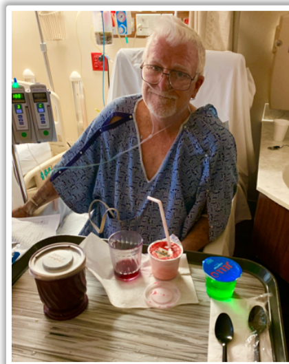
June 24 emergency surgery