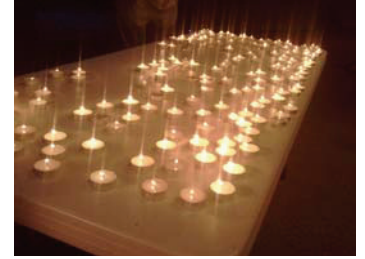
Candles represented friends we commit to share the gospel with

Our favorite time came at the end of the day. When studying Scripture that morning, we'd asked students to write the names of their friends who don't follow Jesus on tealight candles. As we brought our day to a close, students were challenged not to miss an opportunity to "make the ask" and invite their friends to follow Jesus. After a time of reflection, they lit the candles of any friends they felt the Lord urging them to share the gospel with and "make an ask". About 200 candles lit up the front of the room... 200 students who could potentially say 'yes' to Jesus this year! Pray that these candles would become true followers of Jesus!