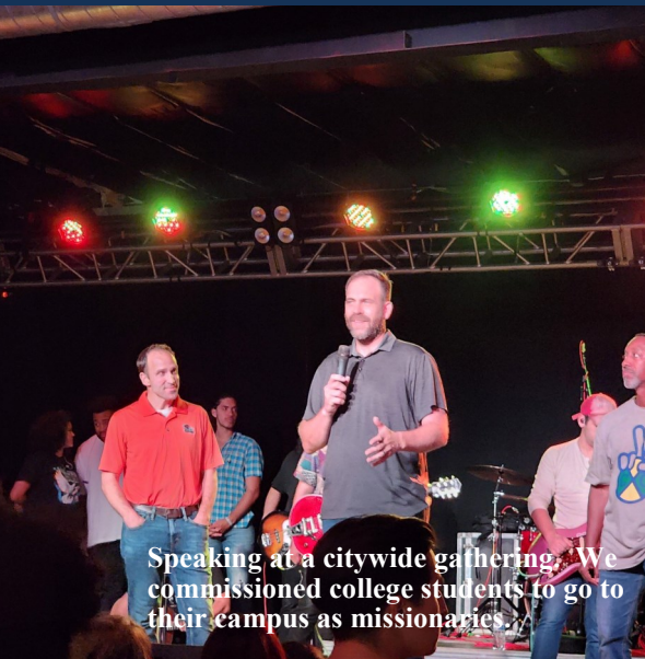
Speaking at a citywide gathering. We commissioned college students to go to their campus as missionaries.