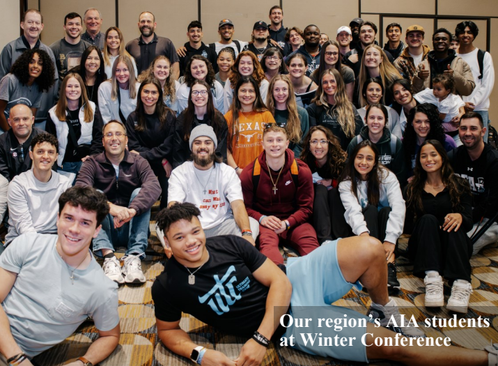
Our region's AIA students at Winter Conference