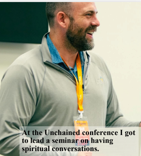
At the Unchained conference I got to lead a seminar on having spiritual conversations.

Watch out for flying discs! This is becoming a more and more common sign around the country as disc golf takes off. Once again this year I was able to both attend and teach at the Eagles Wings Unchained Conference for disc golfers from around the nation. A friend of mine and I shared on how to create space for conversations around spiritual things—on and off the disc golf course. Some of the top pro disc golfers in the nation were in attendance as well as amateur players. The common denominator was a desire to integrate faith and sport together. This lines up very with Athletes in Action. Pray for two things: 1) That those that attended would share Christ more with those around them as a result. 2) That AIA would know how best to minister in this sport.