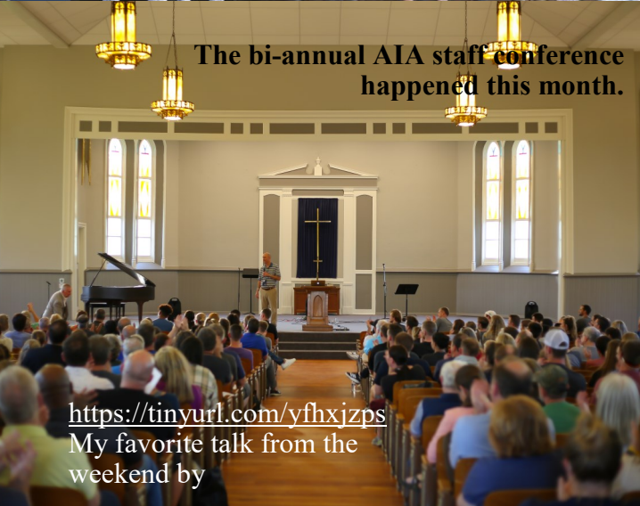
The bi-annual AIA staff conference happened this month.