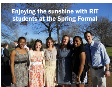
Enjoying the sunshine with RIT students at the Spring Formal