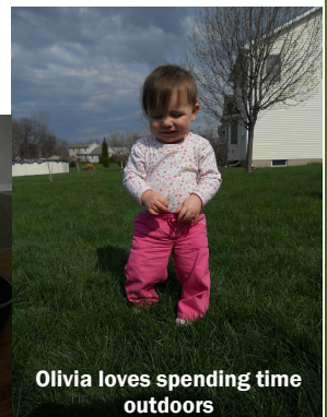
Olivia loves spending time outdoors