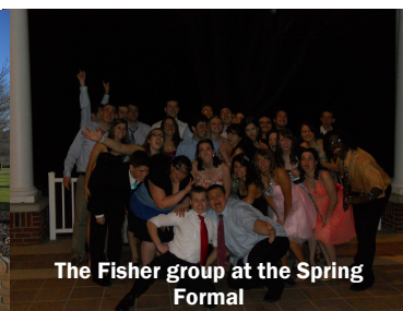
The Fisher group at the Spring Formal