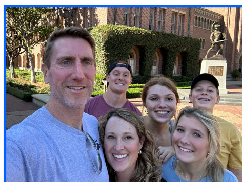
2023 Family selfie at USC 30 years later