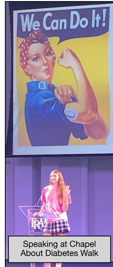
Speaking at Chapel About Diabetes Walk