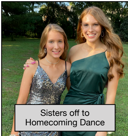
Sisters off to Homecoming Dance