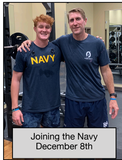
Joining the Navy December 8th