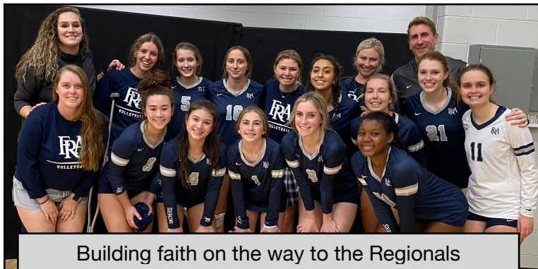
Building faith on the way to the Regionals