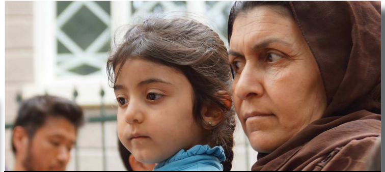
Woman and child at Refugee Center