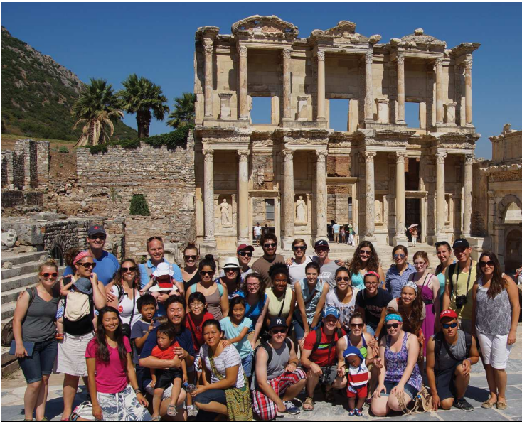
The Northeast Breakthrough Team