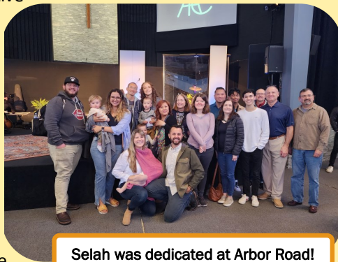
Selah was dedicated at Arbor Road!