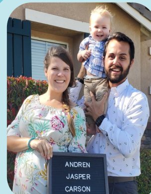
We are excited to announce the name of our 2nd son!

Many of our students are living in midst of the chaos and are struggling to navigate social distancing and community, anger and sadness, persecution and advocacy, joy and mourning. However, the beauty of the Gospel continues to go forth as we engage in powerful conversations with our students and their friends, about what it looks like to do justly, love mercy, and to walk humbly with our God. Please continue to pray for wisdom as we navigate these delicate and tender spaces.