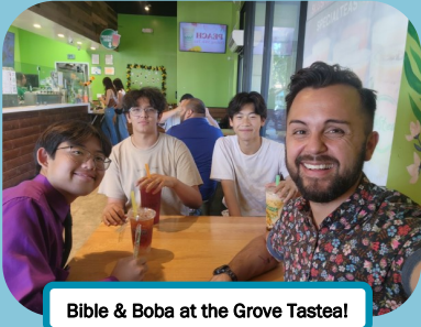
Bible & Boba at the Grove Tasteal