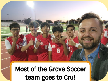
Most of the Grove Soccer team goes to Cru!

As always, thank you for your continued love and prayerful support of the work the God is doing in our local high schools. We COULDN'T do this without you!