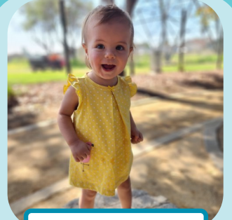
...and SHE'S WALKING!