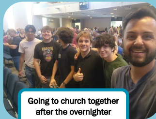
Going to church together after the overnighter