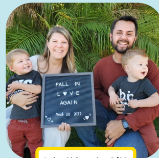
Baby Girl coming 3/22