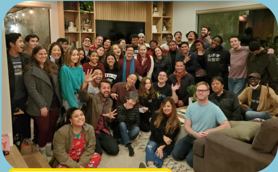
"Most" of our staff and Volunteer team