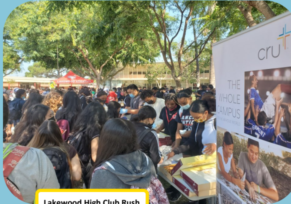
Lakewood High Club Rush

At Lakewood, we likewise had a very sudden invite to club rush. With a few days notice, we held a second club fair at Lakewood High School! By God's grace, we got connected with 150 students! At our first lunch meeting 6 days later, we saw 96 kids in the gym for a Cru meeting! The schools are opening back up and we need prayer! Please pray as Fountain Valley will have their club rush next!