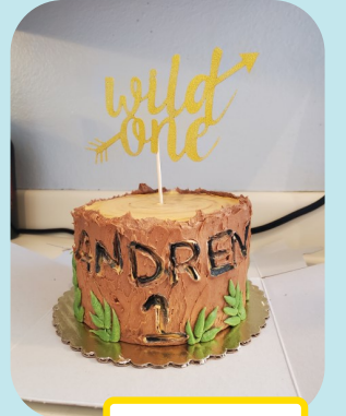
Andren turns one!