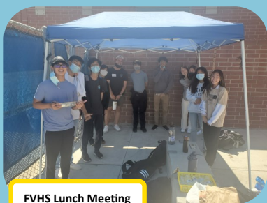
FVHS Lunch Meeting