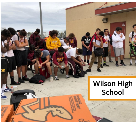
Wilson High School