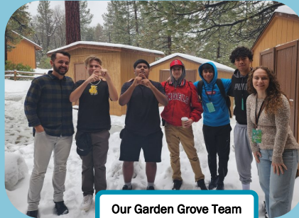
Our Garden Grove Team