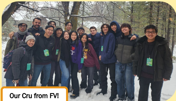
Our Cru from FVI