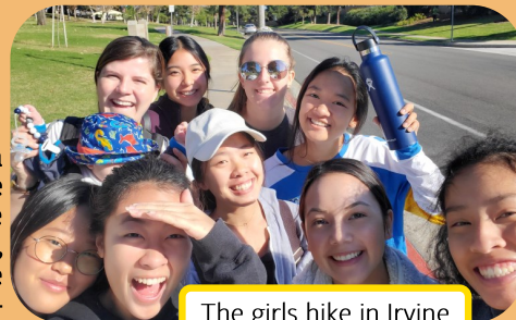
The girls hike in Irvine