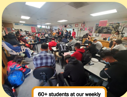
60+ students at our weekly GG lunch meeting

Would you please pray for God to raise up new students in leadership at all four of these campuses? Many of our Servant Team leaders are graduating. Secondly, we have missed one to two years with the other students due to Covid. Please also pray also for our summer camp, Getaway at Biola College in June!