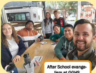
After School evangelism at GGHS