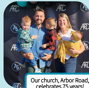
Our church, Arbor Road, celebrates 75 years!