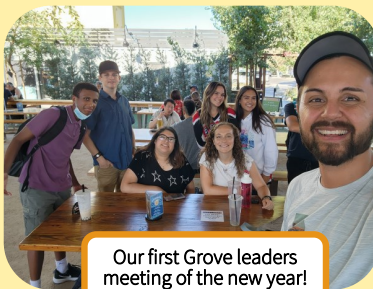
Our first Grove leaders meeting of the new year!

The next club rush was at Fountain Valley! Over three days, we saw 180 students sign up to find out about Cru club. We now consistently see around 45 attend our weekly meetings. One prayer need at FV is for deeper involvement with the students. Many come from church or wealthy backgrounds and don’t realize how much they really need Jesus.