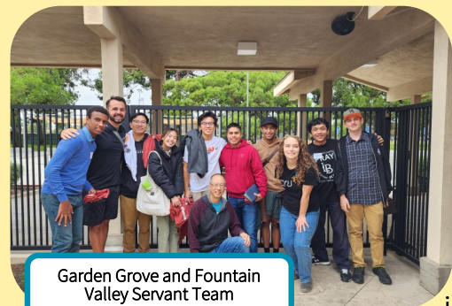
Garden Grove and Fountain Valley Servant Team