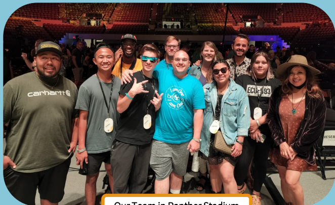
Our Team in Panther Stadium

Following the Getaway, many staff and students will be immediately embark on mission trips all around the world! Our team here in Long Beach is looking at bringing students to Peru and Thailand. Would you be in prayer for us as we prepare for our first National Getaway, as well as our mission Trip?