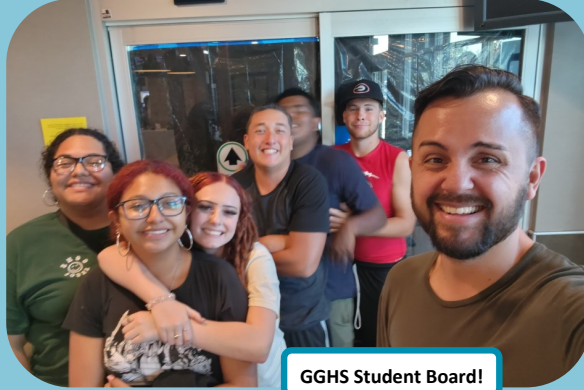
GGHS Student Board!