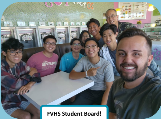
FVHS Student Board!