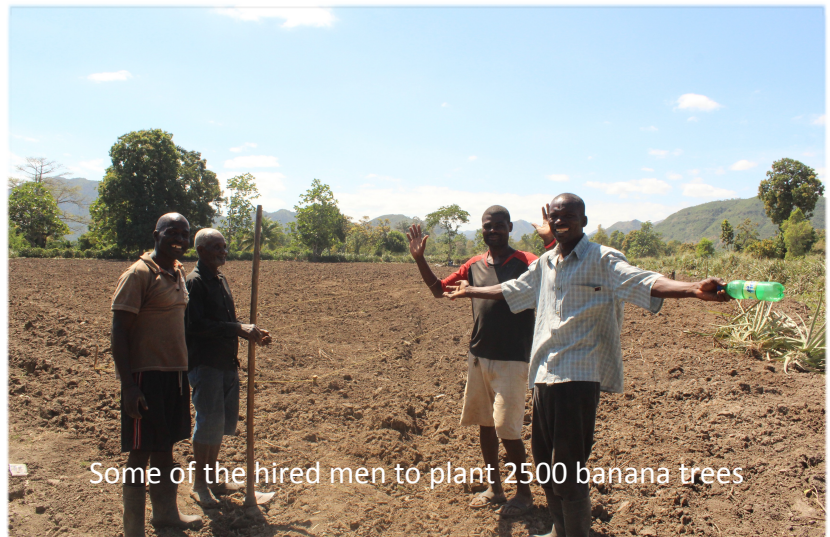
Some of the hired men to plant 2500 banana trees