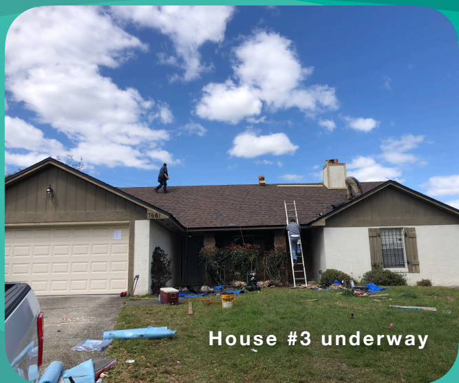
House #3 underway