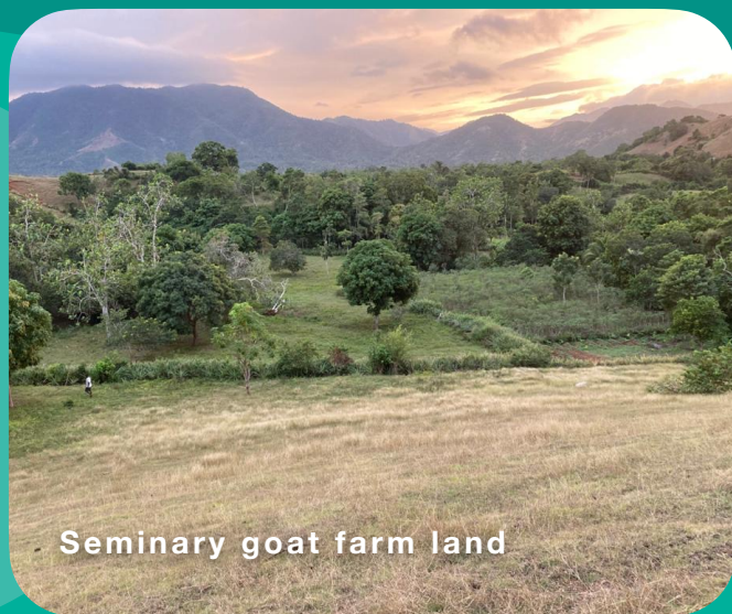
Seminary goat farm land