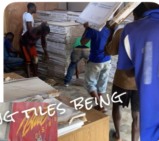
CEILING TILES BEING DELIVERED