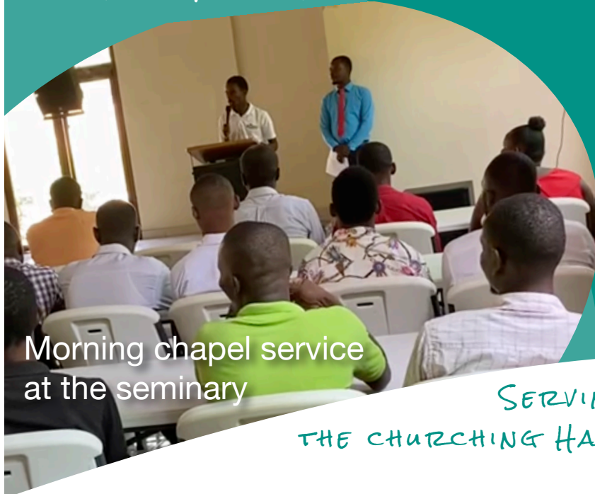
Morning chapel service at the seminary