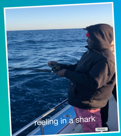
reeling in a shark