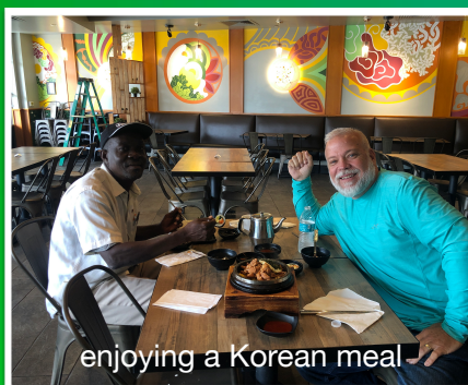
enjoying a Korean meal