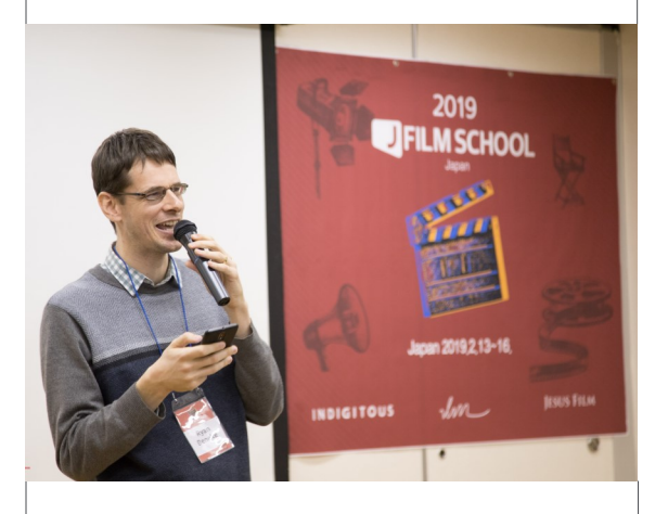
Singing some Japanese karaoke while emceeing at Film School (2/13-16)