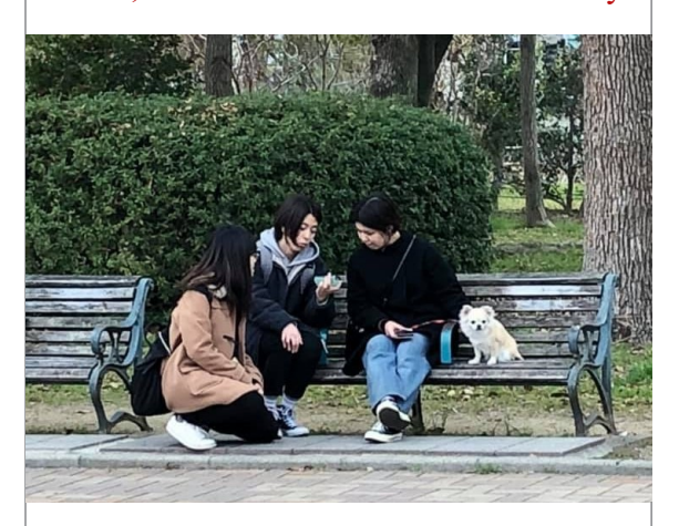
Using Gateway to approach people in the park at Campus Forum (2/25-28)