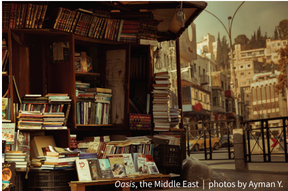
Oasis, the Middle East