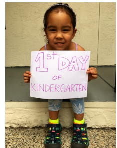
Naomi's 1st day!