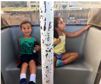
Cru17 Carnival in Fort Collins, CO