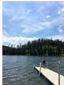
Tosh catching crawdads at Pearl Lake