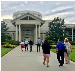
Tour of Cru National Headquarters