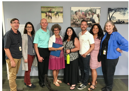
Our care group for the week