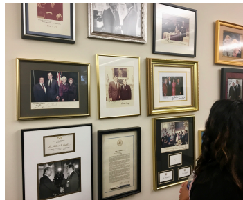
Cru Founders, Bill & Vonette Bright's Legacy