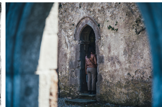
pc: Caleb A.

As we continue trusting God to guide our staff, those in our local community, as well as our own family in the Way of Jesus, would you prayerfully consider a year-end gift of $100, $500, $1000, or some other amount significant to you? Your generous donations allow us to continue training and resourcing teams and individuals as they find commonality with people within the communities of their host-country through the love of Jesus.