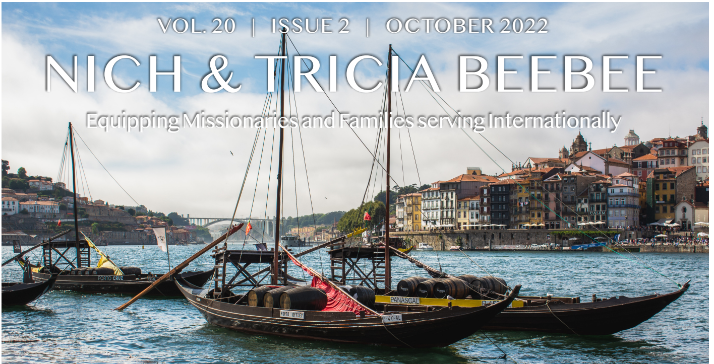
North Africa

Equipping Missionaries and Families serving Internationally