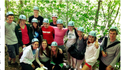
A rock trip teaches about real vs. ideal

Climbing Rocks & Riding Rivers. We are blessed to live in a place rich with opportunities for experiential learning. This semester, we facilitated experiences with dozens of students who learned about themselves, each other, and their Creator while clinging to boulders, gripping paddles, and tackling trails. A favorite was a rock climbing trip where we challenged students to consider the pressure they put on themselves as it relates to their 'real' and 'ideal' selves. We had each student gather 3 rocks from the woods and tell us what 'ideal' each rock represented. Some said, "I want to get better grades" or "Feel better about my physical appearance" or "Keep up with my sister" or "Please my parents." It was fascinating to see them exchange smaller rocks for bigger ones trying to outdo the other students on the trip—little did they know that these rocks would go into a backpack that they would carry with them as they climbed. One student literally had about 40 pounds of rocks on her back! She was trying to keep up with and surpass the achievements of her sister. She left realizing that this weight of comparison she carries around hinders her in life...keeping her from really knowing who God has created her to be and to thrive as that person.