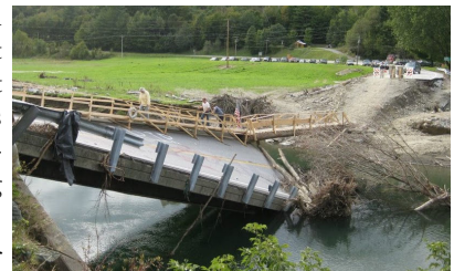
Serving our neighbors after Irene

Cleaning up after Irene. We led a group of students to Rochester, one of the harder hit cities in VT, to help the local people recover from the hurricane devastation. As we made our way through the city, washed out bridges & roads were only a small clue to the way Irene had turned the lives of each resident inside out. Our work was primarily on one man's home and barn, where we spent hours and hours shoveling mud and loading a dumpster with ruined personal belongings, tore out dry wall & insulation, pulled nails out of trim to be reused, and pressure washed the dirt from salvageable items. The work was back-breaking. It was an honor to serve the community & be Christ's hands and feet to them while, at the same time, a good reminder that Heaven is always the best place to store up our treasures (Luke 12:33).