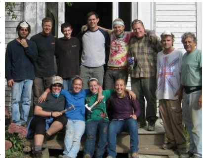
Hurricane Irene clean-up team