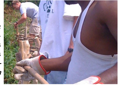
Serve Burlington—a new ministry!